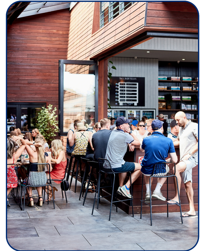
FULL VENUE 500-650 People