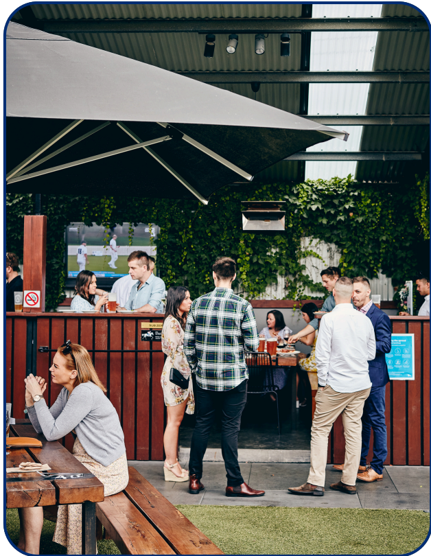
THE STABLES 5-50 People

There are 3 spaces at our Fingal venue to choose from. The Stables, The Birdcage or Whole Venue.