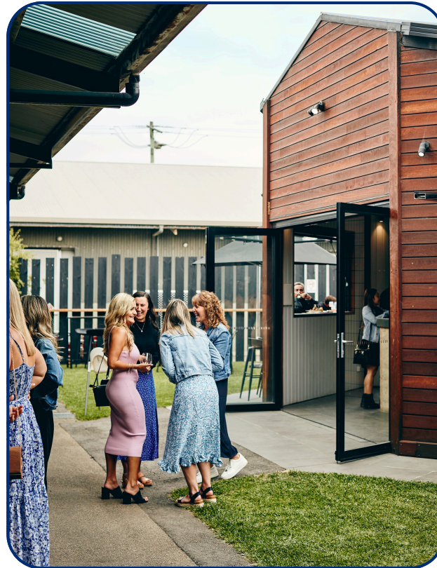
THE BIRDCAGE 50-200 People